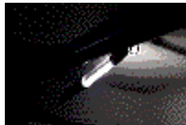
NEW ARB LIGHT