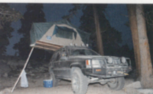
The lone Jeep on the journey was our Project Grand Caddy. As you can see, it was forced to camp by itself.