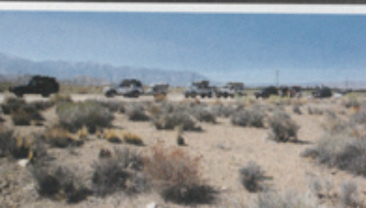
Our group gathered together and prepared to depart from the Hi-Desert floor.