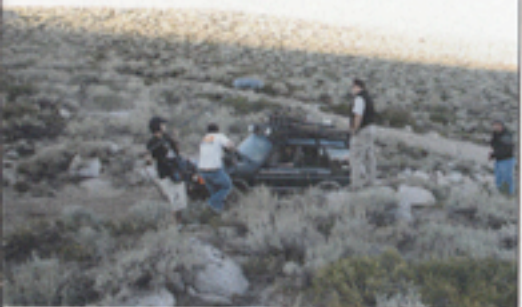
Along the trail at any given time we could find the Outdoor Channel film crew hard at work.

The Sierras stretch almost 400 miles along California's eastern border and proved to be a formidable and almost impenetrable barrier to early, westward-bound settlers. This range of mountains started forming a few hundred million years ago and has been shaped and molded by Earth's violent geophysical forces, glaciers, and extreme weather ever since.