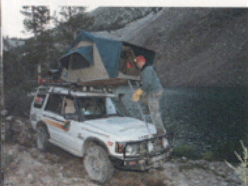
After a long day on the trail, the producer of Four Wheeler TV , Larry Saavedra, gets ready to hit the bunk. This is a room with a view!

introductions to those meeting for the first time.