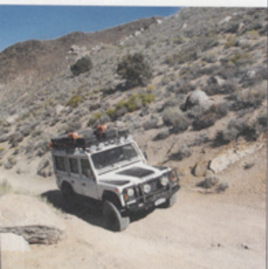
Brett Camot's very nicely equipped Defender 110.