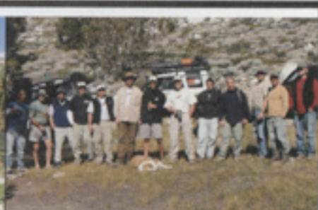
The crew of this awesome Sierras adventure.