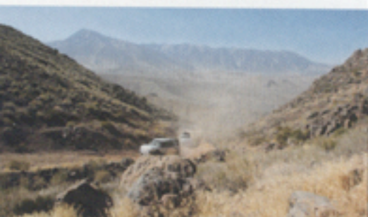
The Rovers raced up the eastern side of the Sierras. The elevation at this point is about 8,000 feet.